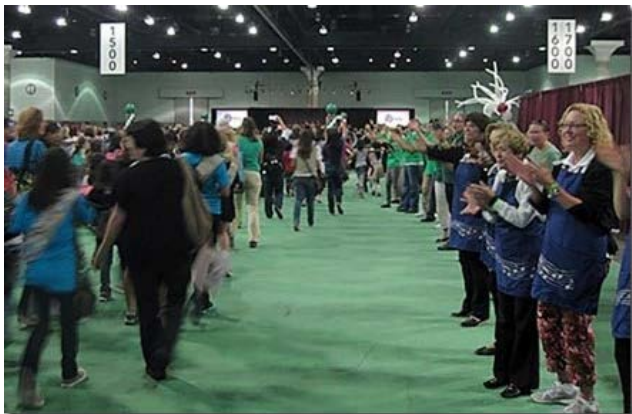
An enthusiastic welcome to participants.

Hosted by Girl Scouts of Greater Los Angeles (GSGLA) for the second time (first in 2011), Girltopia: The World of Girl was an all-day event all about exploration, empowerment, and Girl Scout spirit. The event celebrated all things "girl" through activities aimed at sparking creativity and leadership in thousands of girls and young women.