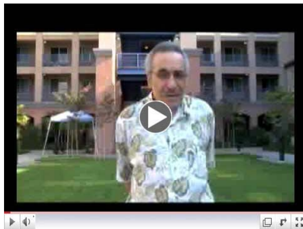
Clothes The Deal Promo